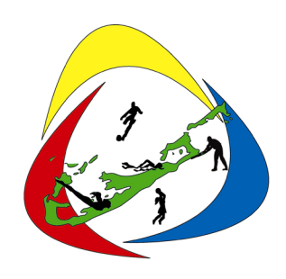
Department of Sport & Recreation

Sport Organizations should ensure, before applying for recognition, that they have met all the requirements for the category of recognition that they seek. It is imperative that they produce documents in conjunction with their application which confirms that they are the sole organizing body for the sport they represent and that they have an open membership available to all.