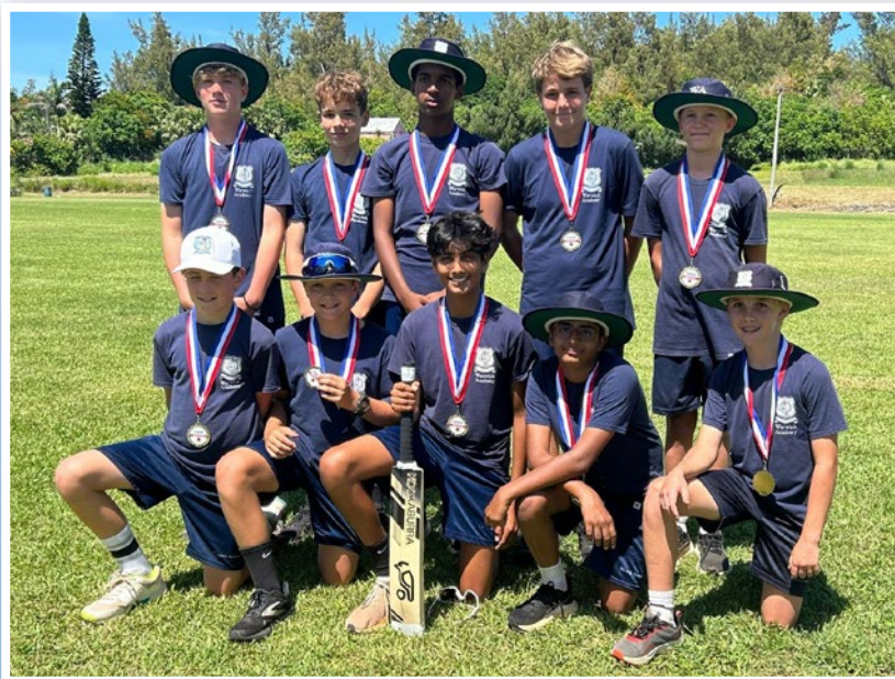
Top Right Inset Photo: Warwick Academy Bermuda Cricket Board BSSF Middle School Boys Champions 2025