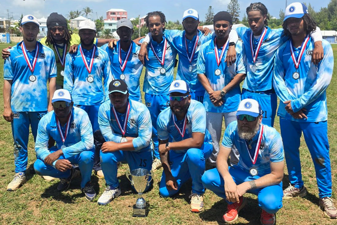
Below: Bermuda Cricket Board First Division T20 League Champions 2025