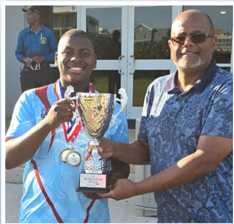
Top Inset Photo: Bermuda Cricket Board Skyport Knock Out Cup 2025 Champions