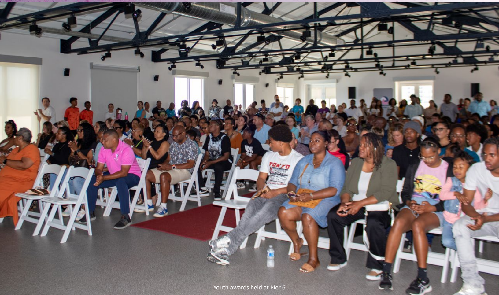
Youth awards held at Pier 6